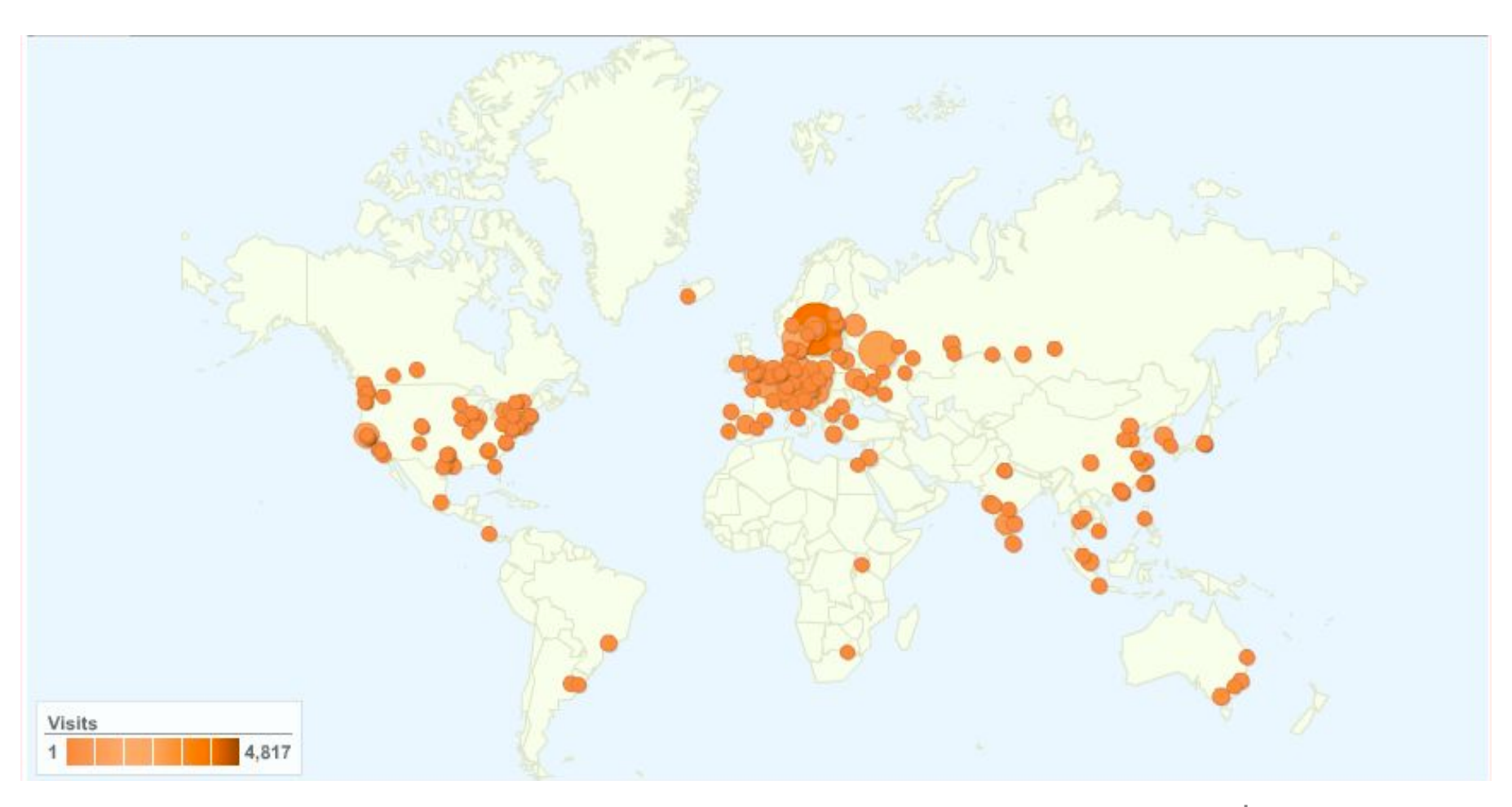
107,091 visits from 5,110 cities, 30 days to March 24th