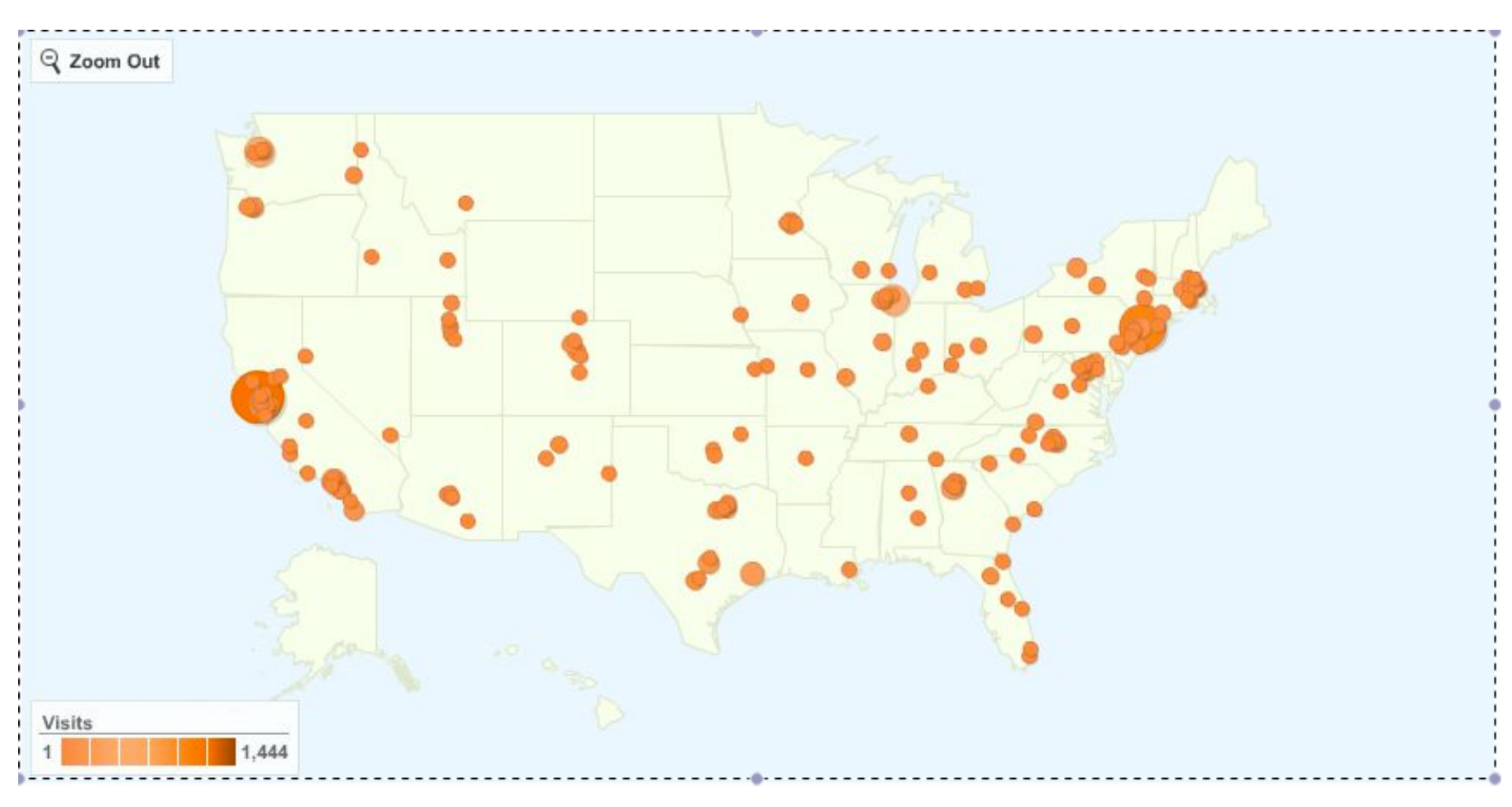
24,082 visits from 1,850 cities, 30 days to March 24<sup>th</sup>